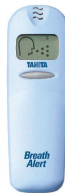
Figure 1 - Breath Alert™ (Tanita Corporation, Japan).

Oral halimetry was performed for the quantification of halitus and the differentiation of sources of odor using a portable Breath Alert™ device (Tanita Corporation, Japan) (Fig. 1).