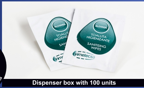
Dispenser box with 100 units

Protection with face shield during training ensures maximum hygiene for the practice of mouth-to-mouth resuscitation.